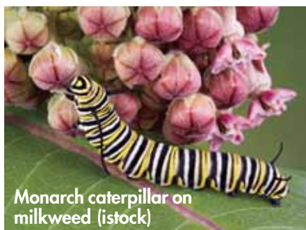
Monarch caterpillar on milkweed