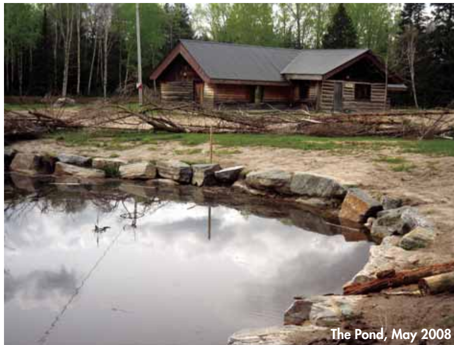
The Pond, May 2008