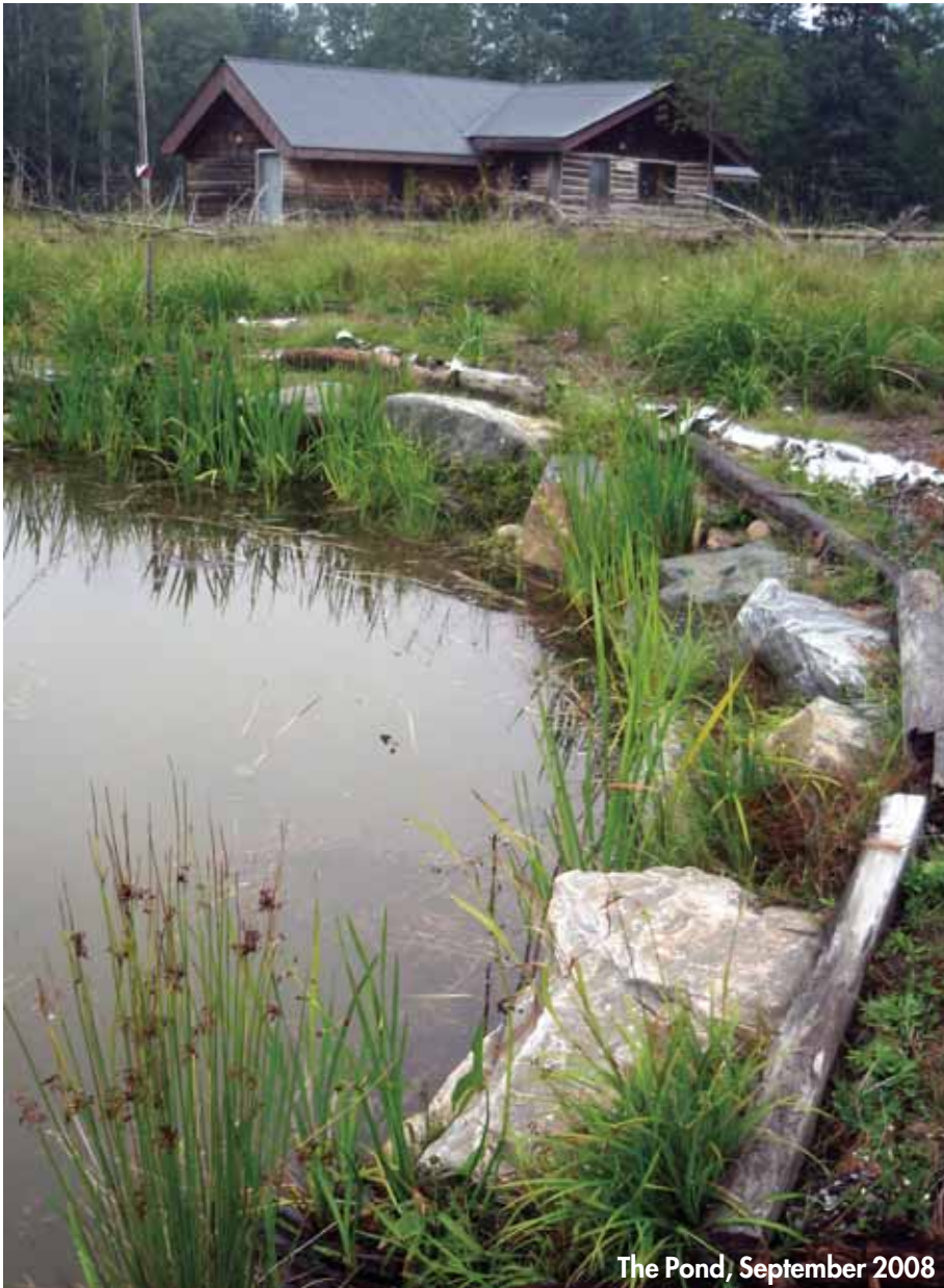
The Pond, September 2008

with teepee and archery range; wetlands, swamps, marshes and a pond; orienteering courses; a commercial style maple sugar bush; and canoe trips for secondary schools.