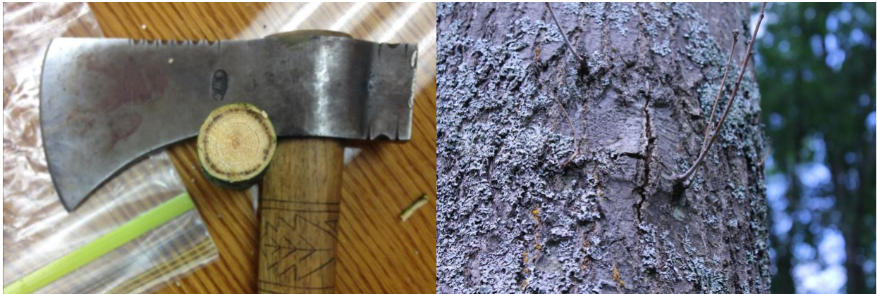
Left: Vascular staining caused by fungal growth.