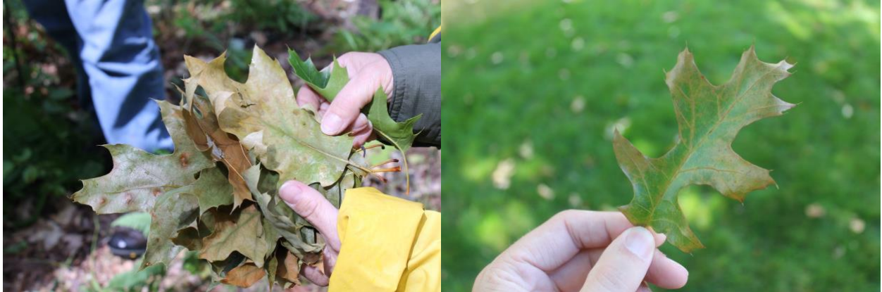
Leaves from infected oak trees. Browning and wilting tend to begin along the outer edges first and moves inwards toward the middle margin.